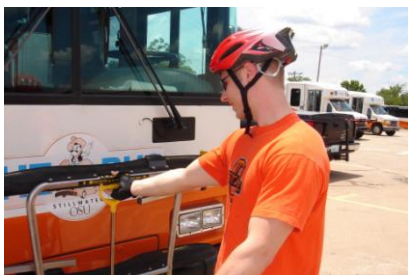
Lowering the Bike Rack