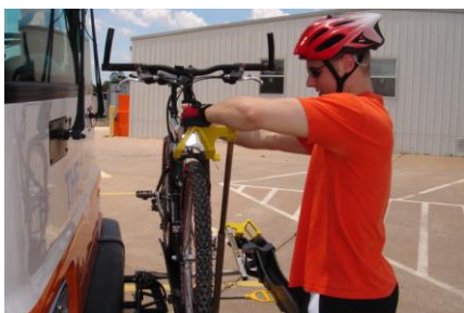
Securing the Support Arm

Communication and goodwill are keys to buses and bicycles sharing the road. Bus drivers are required to signal when pulling to the curb at a bus stop. Look for the flashing lights of an overtaking bus, then signal and pass the bus on the left when clear. Never endanger bus passengers or yourself by passing between bus and curb!